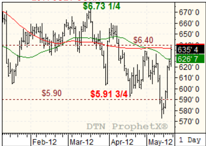
2011 JULY CORN