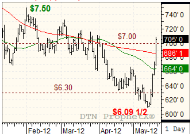
2011 JULY KC WHEAT