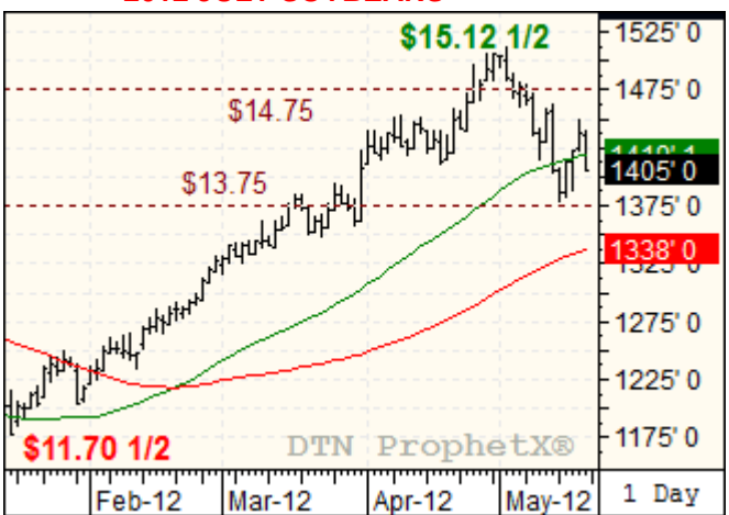
2012 JULY SOYBEANS