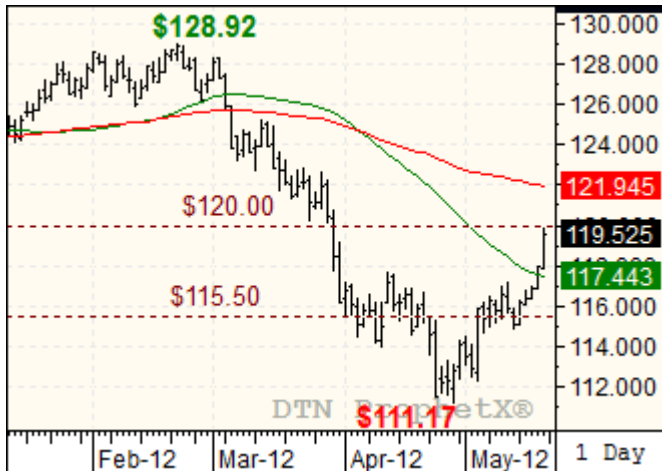
2012 JUNE LIVE CATTLE