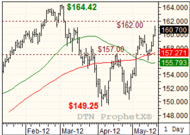
2012 AUGUST FEEDER CATTLE